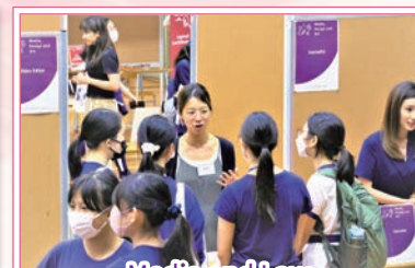
Media and Law