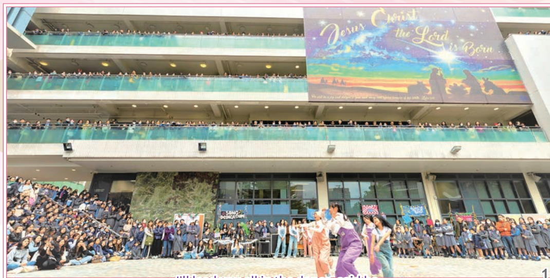
I'll lead you all in the dance, said he.

More meaningfully, this pioneering project offered our students hands-on entrepreneurial training and lessons on how to set up a digital economy. They also learnt about the creative industry firsthand when creating a virtual world from scratch, on top of designing products to market and drafting the promotional catalogue. This is but one more example of how our Technology School has been making inroads, and transforming students into web designers and entrepreneurs.