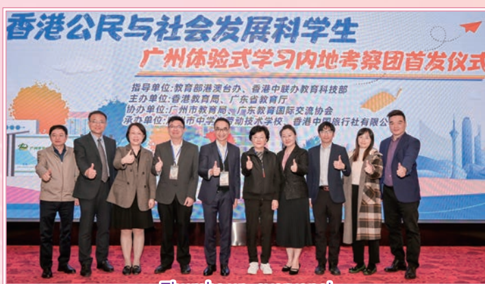
Thumbs up, everyone!

Accompanied by a dozen teachers including the Headmistress and a Deputy Head, the group enjoyed rare privileges most tourists do not get to experience. They had an adrenaline rush as they took part in a simulation exercise in an overturning car to learn about the importance of seat belts, tried abseiling out of a window in an emergency, and followed evacuation procedures in an earthquake.