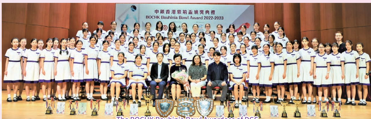
The BOCHK Bauhinia Bowl Awardees of DGS

Our Sports School has been rising from triumph to triumph. This was evident in the number of DGS recipients at the BOCHK Bauhinia Bowl Awards Presentation Ceremony on 6 July 2023. In addition to acknowledging the Headmistress for her dedication to the promotion of sports in schools in Hong Kong, our contingent of athletes were recognized for their outstanding accomplishments in their respective individual and team sports.