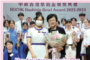
Headmistress receiving a bouquet for her contributions to promoting sports in HK schools

On 29 November 2023, our Cross Country Team gamely assembled at Tai Tong Country Park to defend their overall champion title in the annual interschool competition. Satisfied that they were declared number 1 again, they hit the books to prepare for the mid-year examinations a day away.