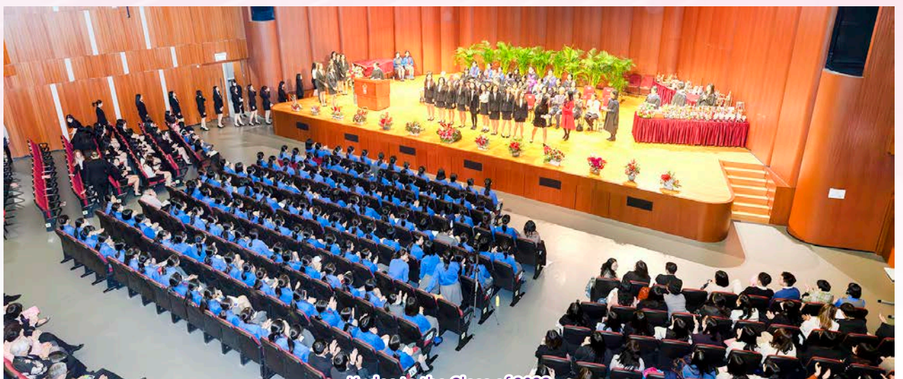
Kudos to the Class of 2023