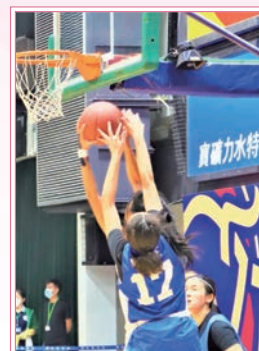
Basketball: true grit