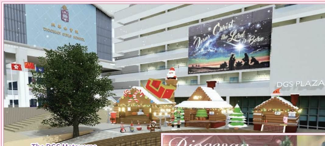
The DGS Metaverse

Fröhliche Weihnachten! This year's Mini Bazaar was held on a chilly 20 December morning. This highly anticipated occasion had scaled up into a total of 37 sale stalls, 18 game stalls, and even a bouncy castle!