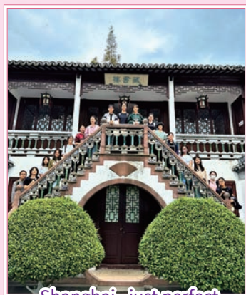
Shanghai - just perfect

Participants fondly remembered the scrumptious meals they shared, the friends they met, and appreciated their Chinese heritage even more.