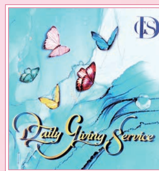
Passing with flying colours

With the blessings we have received at school, such as the spiritual nurturing, the skills, the opportunities, and the bonds we have formed, we are empowered to share our endowments with others to make the world a more beautiful place for all. Like the butterfly effect, the Diocesan spirit can spread and benefit even more people.