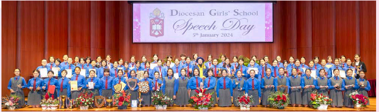
Headmistress with prize recipients