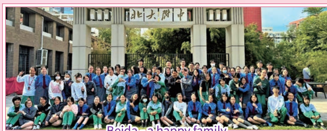
Beida - a happy family

Starting from 30 October to 3 November, six groups, chaperoned by Chinese Language, Chinese History and Geography teachers, left to learn with their counterparts at the Affiliated High School of Peking University,