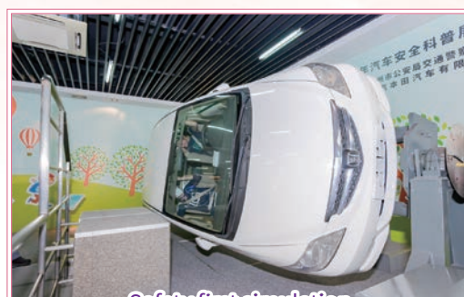
Safety first simulation