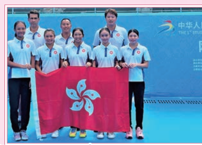
Team HK (Tennis) at the 1 st Youth Games of the PRC