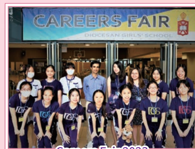
Careers Fair 2023