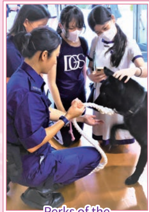
Perks of the Hong Kong Police

Our alumnae's sense of belonging to the school has always been a priceless asset; at the Careers Fair 2023, many returned enthusiastically to share invaluable experiences with current students across different levels so that they may also pass with flying colours in their studies, future career and in life.